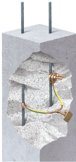
Can be used with bolted clamps or exothermic welds

Kingsmill Earth Points (with green/yellow tail) provide bonding points to reinforcing bar.