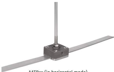
AATBxx (in horizontal mode) - Solid Circular or Tape