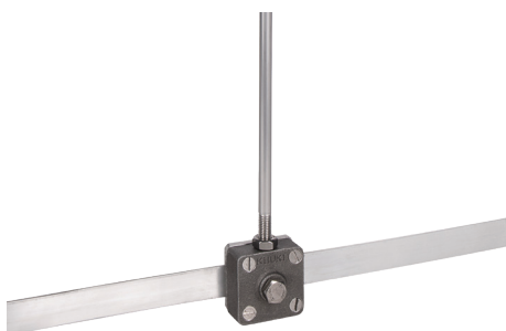
AATBxx (in vertical mode) - Solid Circular or Tape