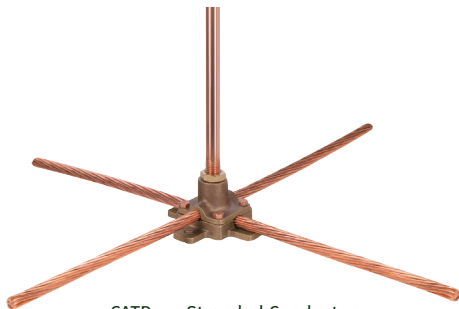
CATBxx - Stranded Conductor