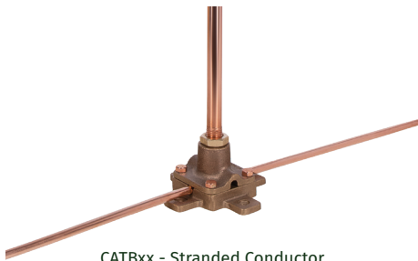
CATBxx - Stranded Conductor